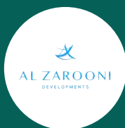
Al Zarooni Developments

A residential developer focused on accessible, lifestyle-oriented communities.