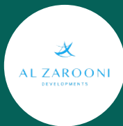
Al Zarooni Developments

A residential developer focused on accessible, lifestyle-oriented communities.